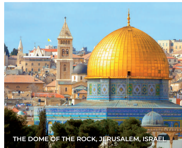
THE DOME OF THE ROCK, JERUSALEM, ISRAEL

ancient crusader port city of Akko , a fascinating UNESCO World Heritage town with new excavations that date back 1000 years. Highlights of the old city of Acre include the beautifully renovated Knights' Halls of the Hospitaller Fortress as well as the fascinating underground tunnels and pathways. After lunch, drive to Nazareth , where you'll visit the Basilica of the Annunciation in Jesus's hometown. Continue on to Cana for a brief stop at the Wedding Church , where Jesus changed water into wine. Thereafter, drive to Tiberias for an overnight stay.