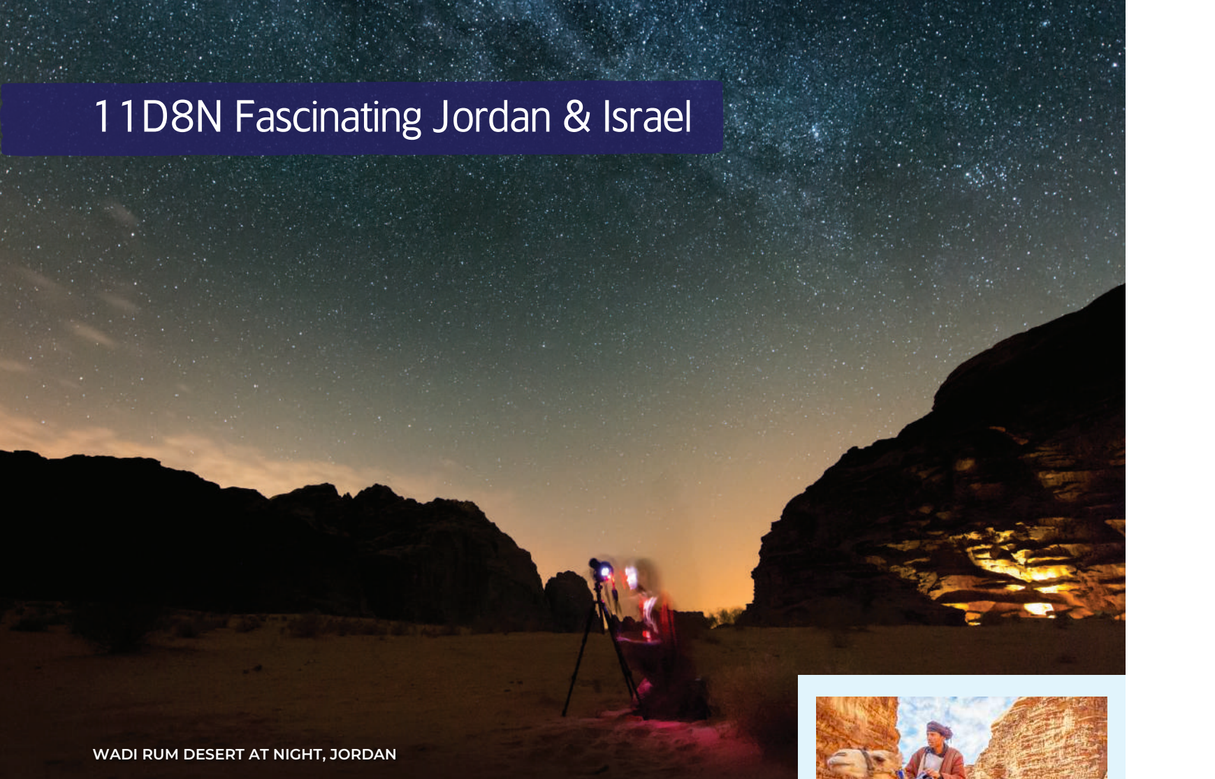
WADI RUM DESERT AT NIGHT, JORDAN